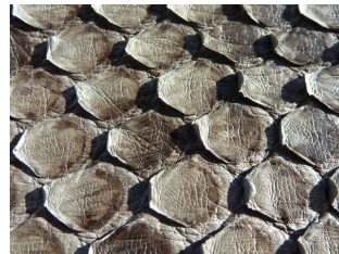
Snake scales lift with the time.