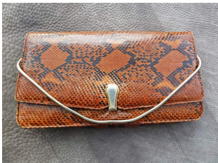
Python leather bag.

Important for any cleaning and maintenance: Always test before in a hidden area!