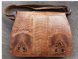
Cobra leather bag.