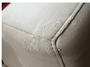
The surface starts peeling off. Impossible to repair.

Preserve older imitation leather with Vinyl Protector . The Vinyl Protector prevents soiling and reduces friction damages. The Vinyl Protector does not generate an artificial gloss. Apply evenly with a soft cloth and let dry.