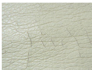
Fractures extend all over the seating area. Impossible to repair.