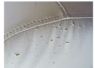
Cat scratches: Laborious down- gluing of protruding fibres as a last resort.

COLOURLOCK Australia • Swissvax Australia 7 Santavea Mews, Halls Head, Mandurah 6210, Western Australia Tel. (+61) (0)429 217 044 e-mail mailto:sales@swissvaxaustralia.com • Web www.colourlockaustralia.com.au