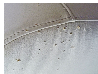
Cat scratches: Laborious down- gluing of protruding fibres as a last resort.

COLOURLOCK Australia • Swissvax Australia