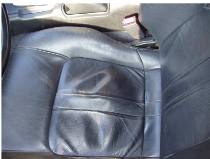
Such deformations are normal in the seat area of older cars

Only saddlers and upholsterers might be able to remove such damages through upholstery work. Wrinkled leather clothing can be improved with stretching and heating with a hair dryer. If this doesn't work, washing or dry cleaning may solve the problem.