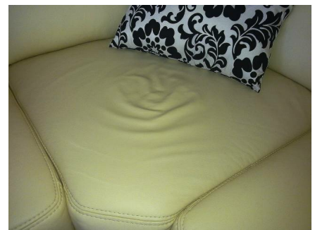
Such deformation is not nice, but can occur on leather