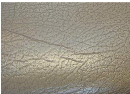
Use the COLOURLOCK Leather Cleaning Brush to get rid of dirt stuck in the depths of the grain.