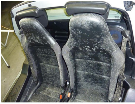
Mildew needs special treatments.