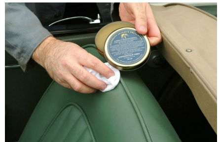
COLOURLOCK Elephant Leather Preserver is ideal for classic cars and especially convertibles.