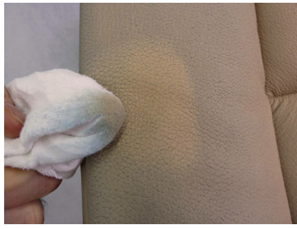
Dye transfer stains sometimes also need special treatment.