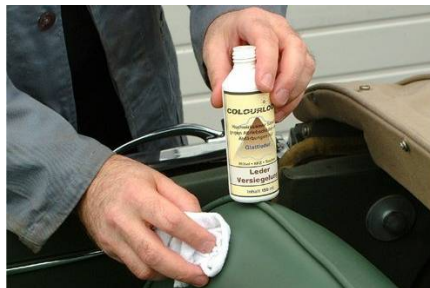
COLOURLOCK Leather Shield protects new leather against friction damage and dye transfer.