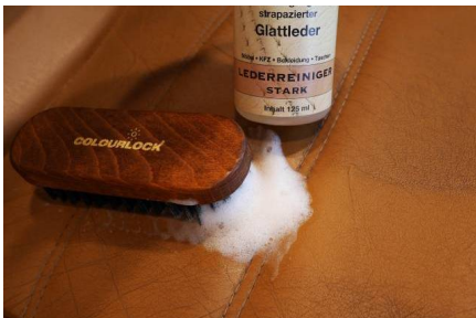
Clean with the COLOURLOCK Strong or Mild Leather Cleaner, according to the degree of soiling.

Important: Our care products are intense in effect. Looking after leather regularly with little amount of product instead of caring seldom and over-applying is the best method. "More" doesn't help "more" when protecting leather.