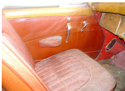
Use COLOURLOCK Strong Leather Cleaner.