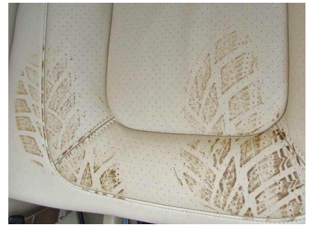
Tyre marks can't be cleaned. Ask for advice.

See also: REPAIRING COLOUR DAMAGES ON CAR LEATHER